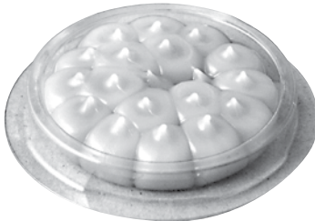
小島 Bird Free pre-dosed application dishes.

小島 Bird Free is supplied in boxes of 15 ready-to-use, pre-dosed application dishes.