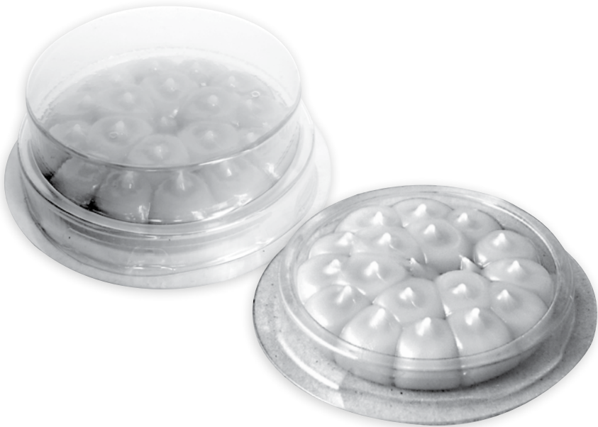
小島 Bird Free dish with and without lid