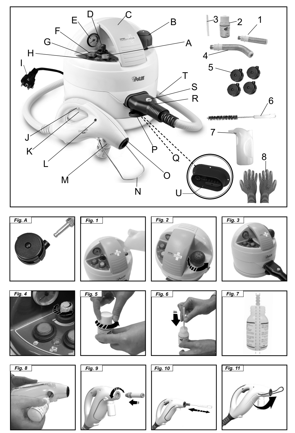
Cimex Eradicator - M0S10008 Edizione 1R10