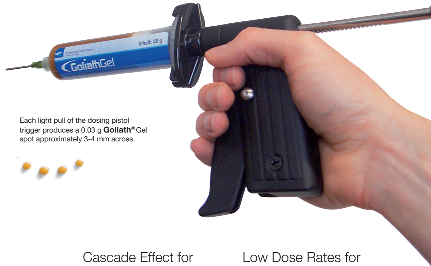
Each light pull of the dosing pistol trigger produces a 0.03 g Goliath® Gel spot approximately 3-4 mm across.

Goliath® Gel is the best way of minimising the cost of cockroach treatment while maximising its effectiveness and convenience for all concerned. Goliath® Gel is a ready-to-use formulation of the advanced insecticide, fipronil, which is more potent and faster working than any other gel bait on the market. Goliath® Gel is easy to apply with precision in the least possible time to give the most rapid, lasting and cost-effective cockroach control. Goliath® Gel is applied discretely and the low dosage ensures the greatest safety and least disruption, even in the most sensitive areas.